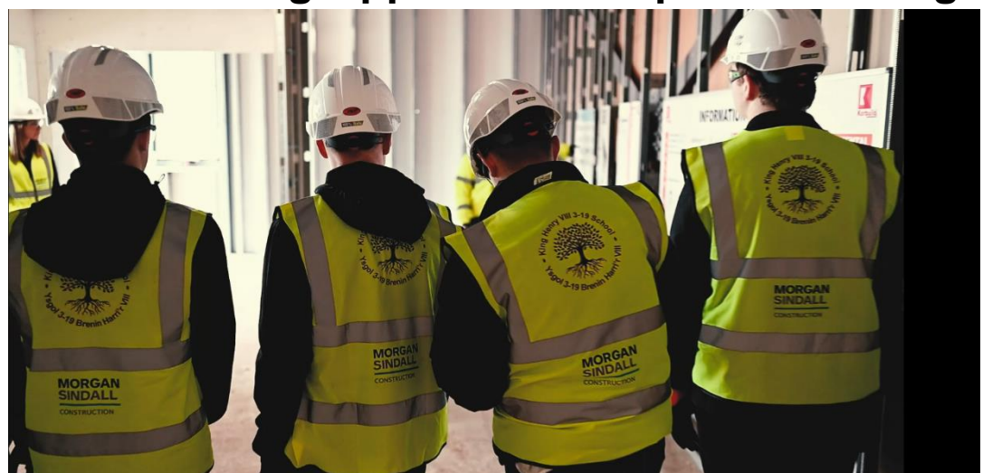
Construction students attend their first masterclass at the new King Henry VIII 3-19 School site

A cornerstone of Monmouthshire County Council's corporate plan is to broaden learning experiences and qualifications for young people. Resources and facilities to teach construction were not possible in the old King Henry VIII school. Morgan Sindall, our construction partner in the new King Henry VIII 3-19 School, were enthusiastic not only to sponsor the course financially and with equipment, but also to provide real world learning experiences and masterclasses throughout the year. Morgan Sindall