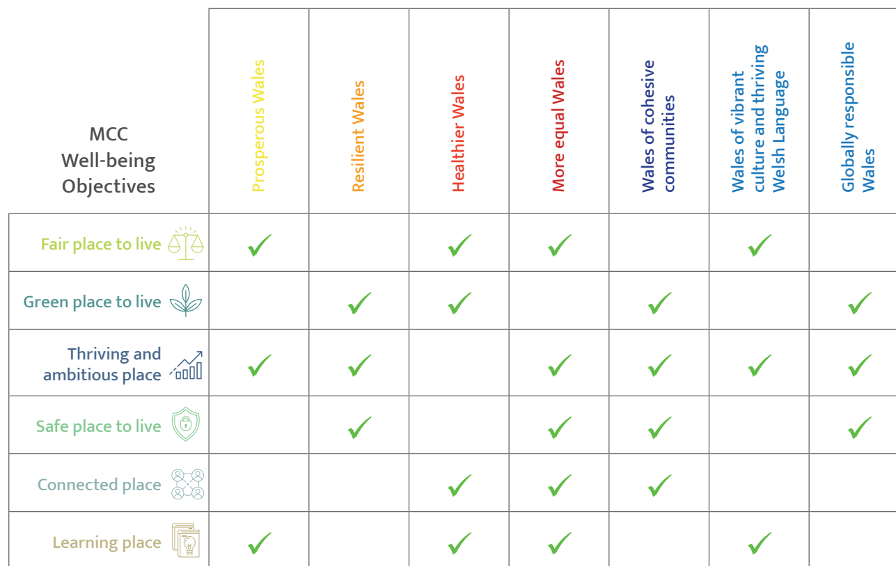
Contribution of Council Well-being Objectives to National Well-being Goals

The contribution our local objectives make towards the seven national objectives has been assessed and is shown in the table below