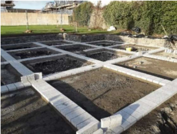
Phase 3 Progress – Planting areas and retaining wall