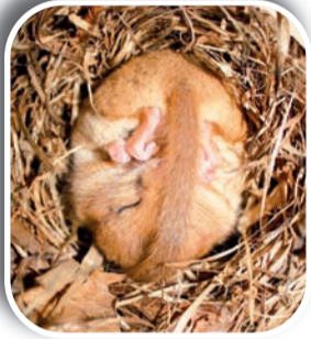
Pathew • Dormouse