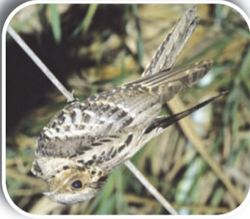
Troellwr Mawr • Nighthjar

We are restoring parts of Wentwood to its natural native broadleaved woodland. You will be able to enjoy the trees, plants and animals that are associated with this important habitat. This is a long term and ambitious plan, but nature's seeds from those that still remain and other woodland plants will soon regenerate as more light penetrates the woodland floor. We can create these conditions by gradually removing the conifer trees.