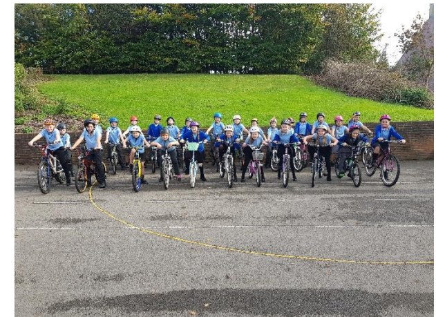
Yr 5 pupils at Archbishop Rowan Williams CIW School, Portskewett

A special mention to two of the children who have learnt to ride a bike for the first time during the school programme and will be taking the test in the near future!